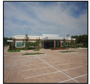
Trustpoint Hospital Murfreesboro, TN

Adolescent Psych Hospital, Ph. 1 & 2 Meridian, MS Crisis Intervention Centers (7 Sites ) Batesville, Brookhaven, Cleveland, Corinth, Grenada, Laurel, Newton, MS Group Homes (3) Water Valley, Dekalb, Senatobia, MS Mississippi Psychiatric Hospital Tupelo, MS Mississippi Regional Psychiatric Hospital Oxford, MS Mississippi State (Psychiatric) Hospital (3 Sites) Whitfield, MS Polaris Hospital & Rehabilitation Center Murfreesboro, TN