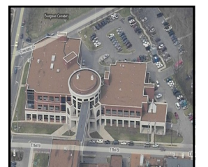
Middle Tennessee Medical Center Oncology Center