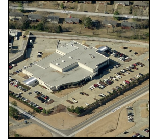
Digestive Health Center NMMC, Tupelo, MS