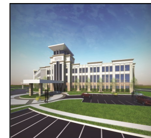
Murfreesboro Medical Clinic Murfreesboro, TN